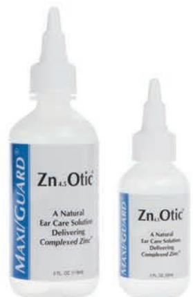
Economical 4 oz

Targets problem ears by restoring the integrity of natural defense mechanisms.