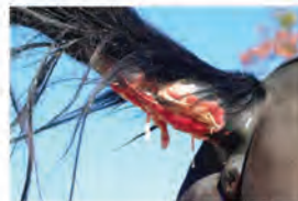
Day 1 of application

In addition, it does not stimulate exuberant granulation tissue (proud flesh). Zn7 can be used on exposed or bandaged areas.