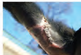
Day 36 of application